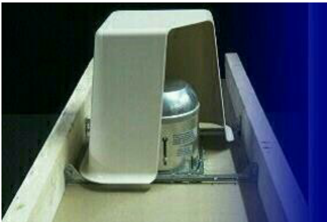
UL/IEC tested Canned Light Covers over recessed lighting to protect light fixtures and stop excess air leakage.