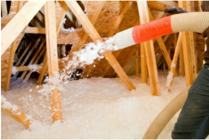
Blown In Cellulose added into attic to improve attic to R49 thermal heat resistance.