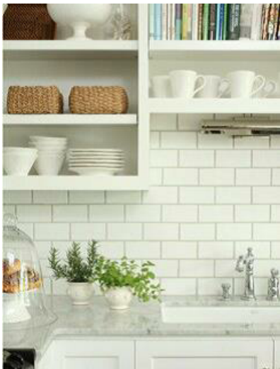
Backsplash Tile selection