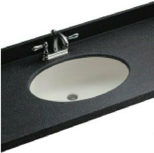
Example of under mount sink and new faucet. Model AR345