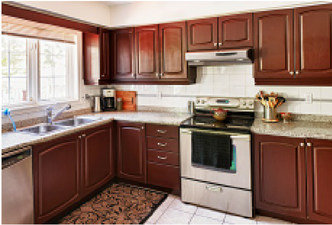
The color and style you selected for your cabinets.